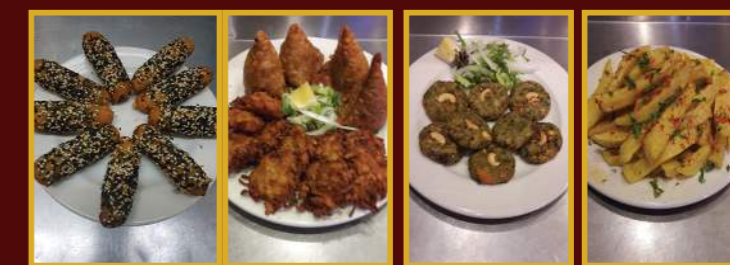
Cheese and Potato Roll Samosa & Chilli Bite Fresh Veg Kebab Masala Chips