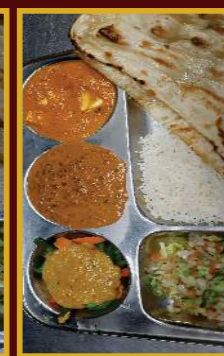
Vegetable Platter R150.00