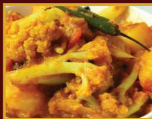
Aloo Matar Gobi