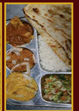
Seafood Platter R190.00