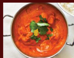
Chicken Tikka Masala