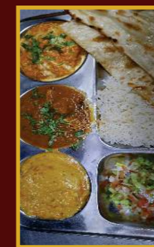
Meat Platter R180.00