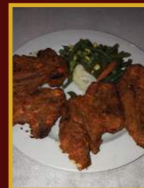
Tandoori Lamb Chops